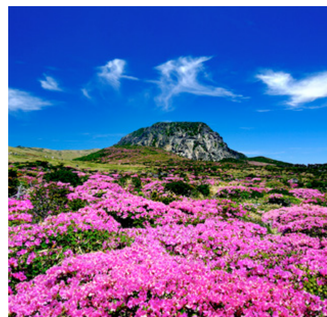
WCBCT2022 | South Korea