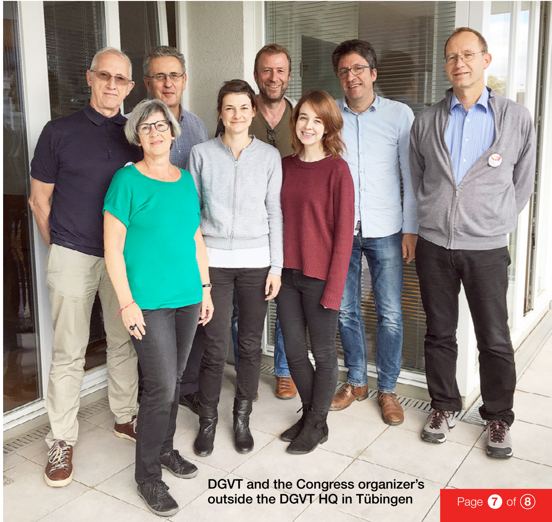
DGVT and the Congress organizer's outside the DGVT HQ in Tübingen