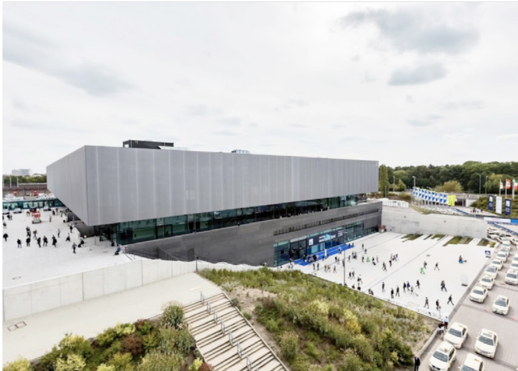
The Conference Venue | CityCube Berlin

In addition to the 32 Pre-congress workshops and the 42 International invited speakers that were announced in the Provisional Programme and available on the website www.wcbct2019.org the scientific programme will now include